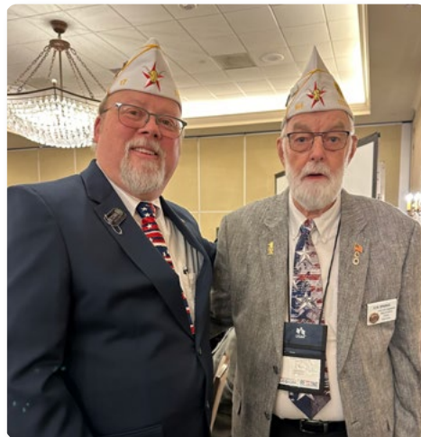
Division 2 - C.W. Sparks - #1 Gold Membership Pin