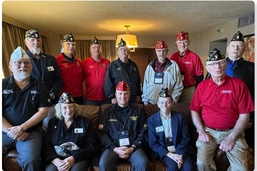
Past Department Commanders Luncheon