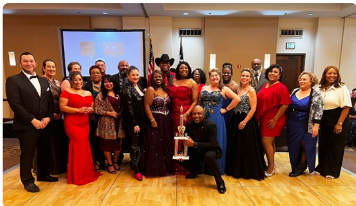
The Jacqueline Smith Foundation hosted its 5th Annual Dancing with the Vets held at the Double Tree by Hilton. Annually, the foundation hosts a Valentine's dance, and Volunteer Veteran Awards Program to educate veterans on resources available to them in the community.

The mission of Fred Brock Post 828 is to enhance the well-being of San Antonio's veterans, their families, the military, and the community by its devotion to mutual helpfulness.